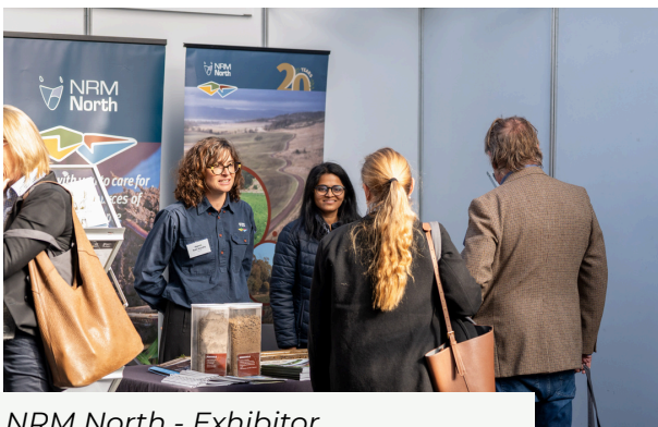
NRM North - Exhibitor

Turn your presence into impact, building relationships and generating leads that continue long after the event.